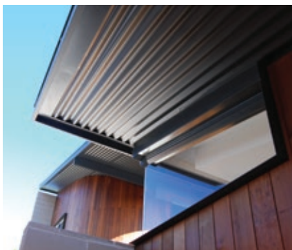
St Ives Residence