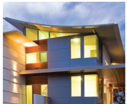
Malua Bay Weekender