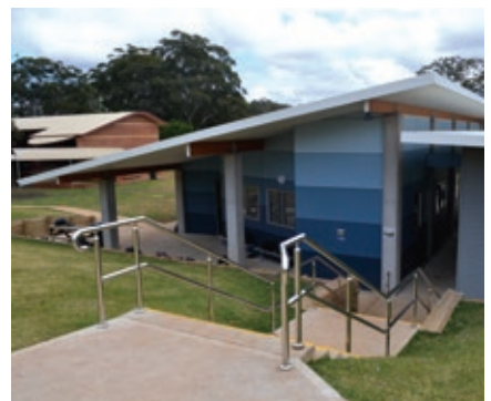
St Pauls High School