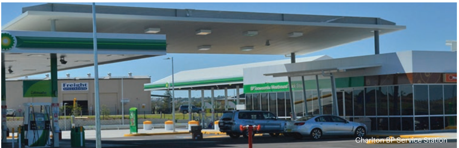
Charlton BP Service Station