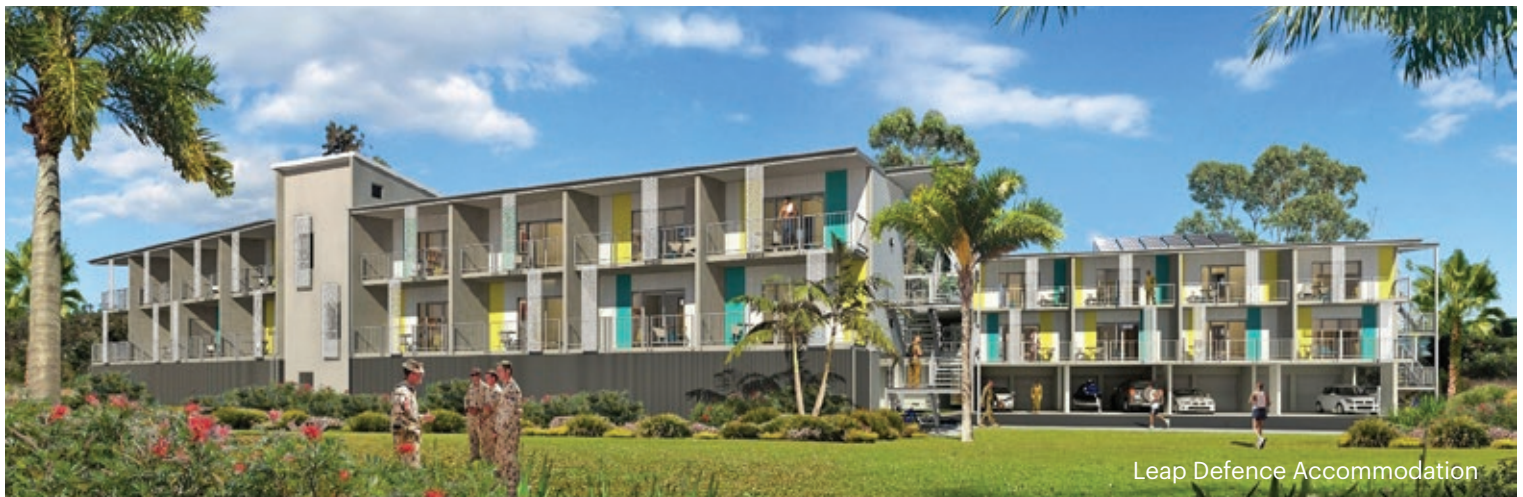
Leap Defence Accommodation