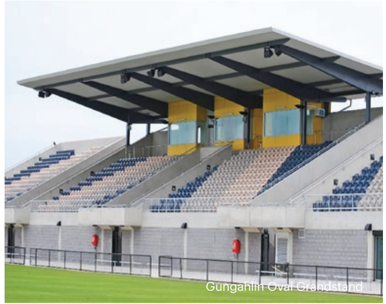
Gungahlin Oval Grandstand