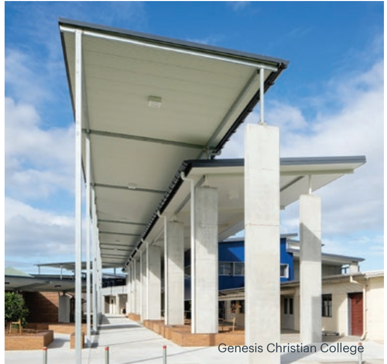
Genesis Christian College