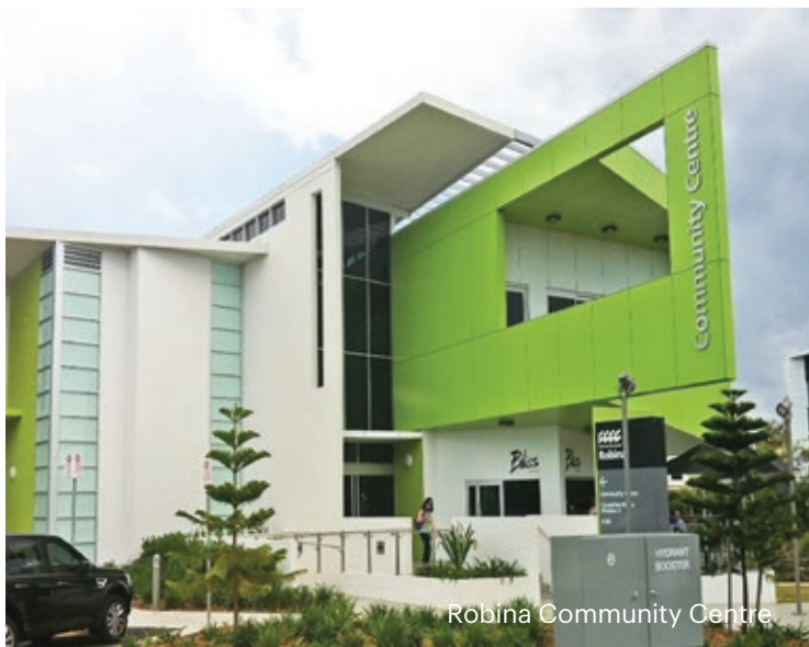
Robina Community Centre