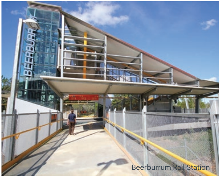
Beerburum Rail Station