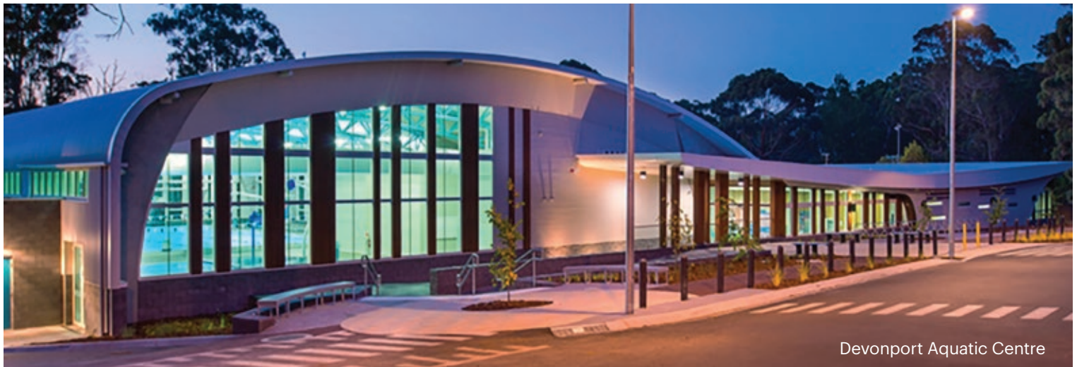
Devonport Aquatic Centre