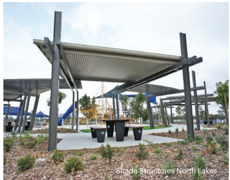
Shade Structures North Lakes