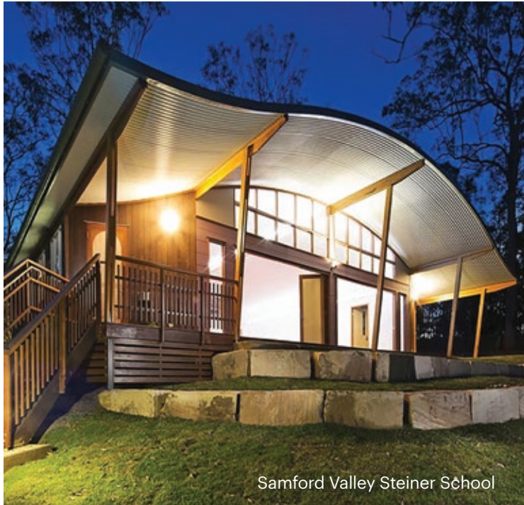
Samford Valley Steiner School