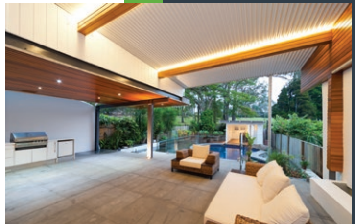
Indoor Outdoor Living

Fully customised insulated roofing solutions, using COLORBOND® steel