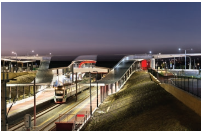
Rail Stations & Infrastructure